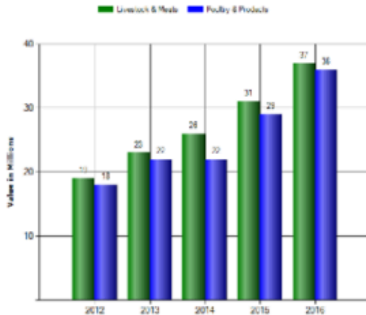
United States Exports of Meats and Poultry to Costa Rica (January - December)