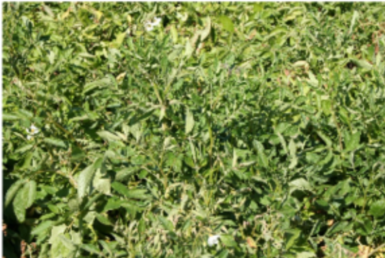
Figure 3. Psyllid yellows foliar damage.

The psyllid acquires the ZC bacterium when feeding on an infected plant or from its mother who can transmit the bacterium to her offspring via the egg. Once infected, the psyllid is always a carrier of the bacterium. The ZC disease usually takes about 3 weeks from infection to produce symptoms in the foliage and tubers.