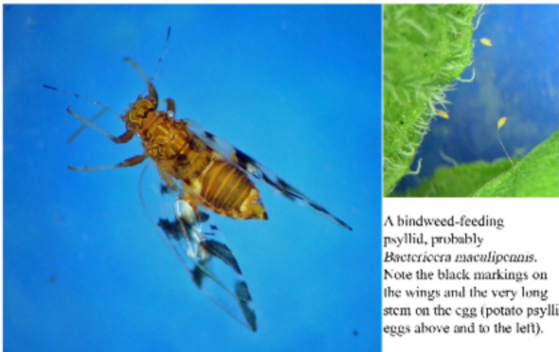
A bindweed-feeding psyllid, probably Bactericera maculipennis . Note the black markings on the wings and the very long stem on the egg (potato psyllid eggs above and to the left).

In some parts of the Northwest, psyllids have been commonly found on field bindweed ( Convolvulus arvensis ) growing in and around potato fields. Potato psyllid ( Bactericera cockerelli ) is known to be able to survive and reproduce while feeding on this plant. There are, however, many species of psyllids living on the plants surrounding potato fields and there is at least one other species that feeds specifically on bindweeds: Bactericera maculipennis . This species is pictured below, including its egg in comparison to potato psyllid eggs. In some areas, B. maculipennis is very common and may be frequently caught on yellow sticky traps meant to catch potato psyllids. Note that separating adults of potato psyllid and B. maculipennis is easy based on the dark markings on the wings of B. maculipennis . There is no evidence that B. maculipennis reproduces on potato or transmits Liberibacter.