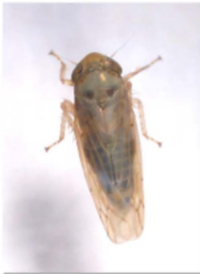
Figure 1. Beet leafhopper adult.