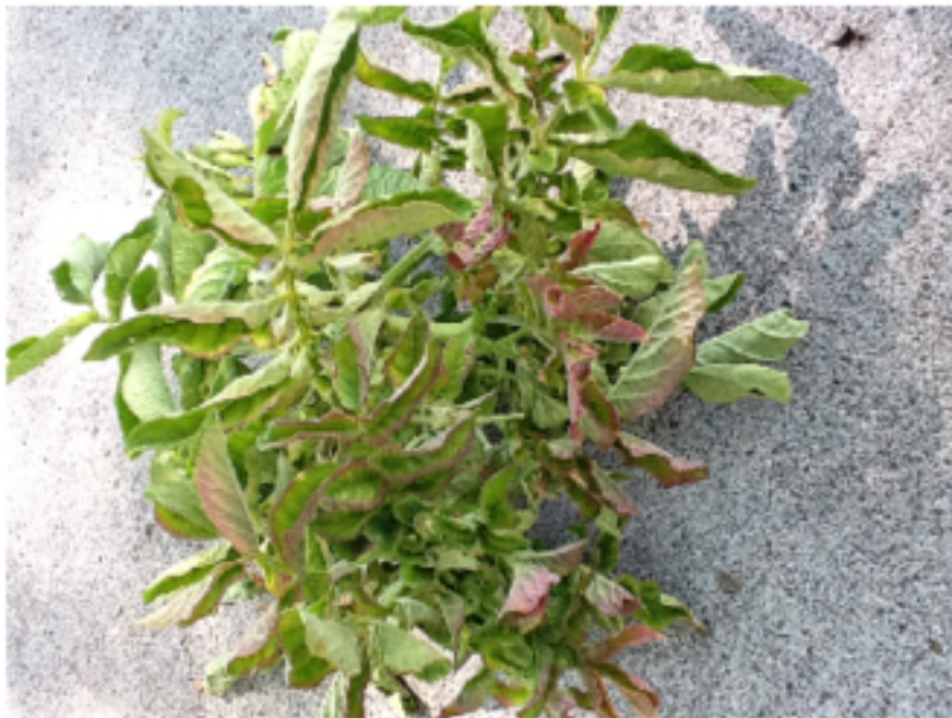
Figure 2. Symptoms of potato purple top disease include upright growth habit, rolling of leaflets, purple and/or yellow leaf discolorations, and elongation of the axial buds, often resulting in aerial tubers, and bushy appearance.